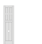
CHOPPING BOARD & TRAY SET 720 X 200 available in Sanded & PTO only