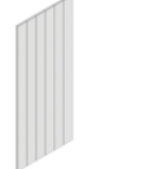
T&G END PANELS 900 X 650 X 19* 900 X 1200 X 19* 910 X 2430 X 19* 960 X 360 X 19* 2430 X 650 X 19*