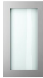
PLAIN FRAME includes clear glass