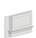
CANOPY 575 X 1000 X 181