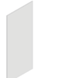
PLAIN END PANELS 900 X 650 X 19 900 X 1200 X 19 910 X 2430 X 19 960 X 360 X 19 2430 X 650 X 19