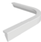
QUADRANT LIGHT PELMET 55 X 430 X 430