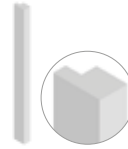
UNIVERSAL MOULDING 35 X 3050 X 60