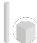
MODULAR PILASTER 900 X 75 X 75