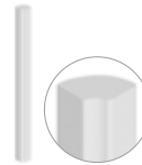
30MM CORNER POST 720 X 30 X 30 (timber painted)