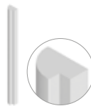
QUADRANT END MOULDING 2450 X 50 X 70