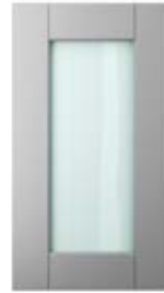
PLAIN FRAME includes clear glass