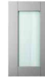
PLAIN FRAME includes clear glass