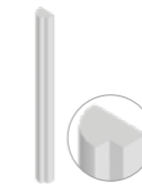
QUADRANT END MOULDING 2450 X 50 X 70